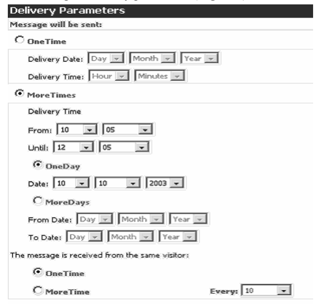
Figure 2. Phase (b) of Message Composition

(b) Following, the actor provides value for the 2 message's delivery parameters (Figure 3).