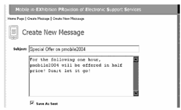
Figure1. Phase (a) of Message Composition

(b) Following, the actor provides value for the 2 message's delivery parameters (Figure 3).